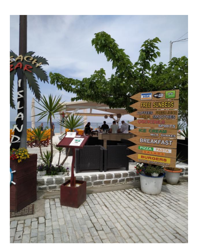
modern town of Thassos, a famous greek holiday destination.