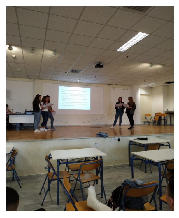
Then they had a Workshop - writing an article