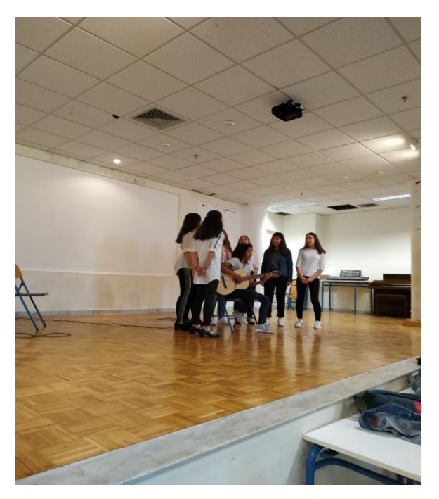
and a variable and interesting program of singing and dancing from the host country Greece.